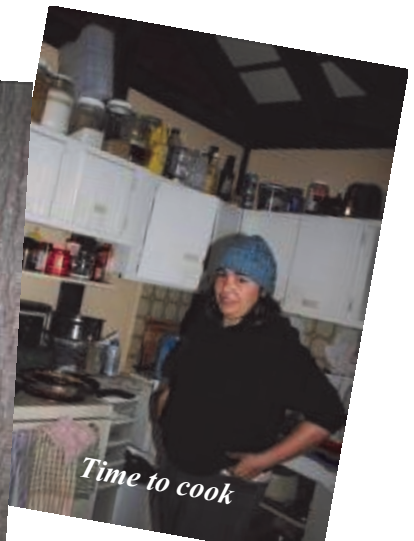
Time to cook