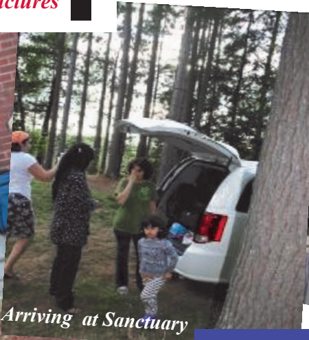
Arriving at Sanctuary