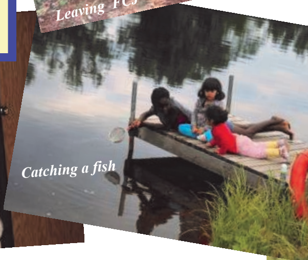
Catching a fish

"As a placement student the camping trip was a great personal and professional experience; I got to enjoy the beauty of nature as well as the beauty of sharing different cultural experiences with all women. Camping serves as a great context to interact with other women as equals and gain an invaluable insight into intercultural communication" L. Dijanich