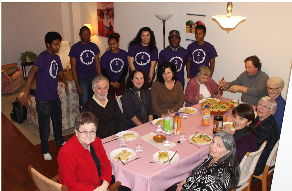
FCJ Refugee Centre's Board of Directors during a special dinner prepared by the Youth Network .

Looking forward to 2014, we are asking for your generous support to allow us to continue the work we do. If you wish to make a donation, please visit our website: www.fcjrefugeecentre.org and make your contribution through CanadaHelps .