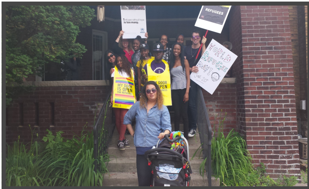
FCJ Refugee Centre joined the Canadian Council for Refugees "Walking with refugees for a stronger Canada" on the World Refugee Day.