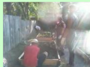
Planting the vegetables

"Just want to express my gratitude to the organizers for a planned vegetable garden at our house. I want to remember the people who participated in cleaning the backyard and who cut the trees for sunlight. The plan was well designed to interest and unite women from different countries."