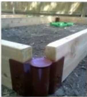
Building the beds