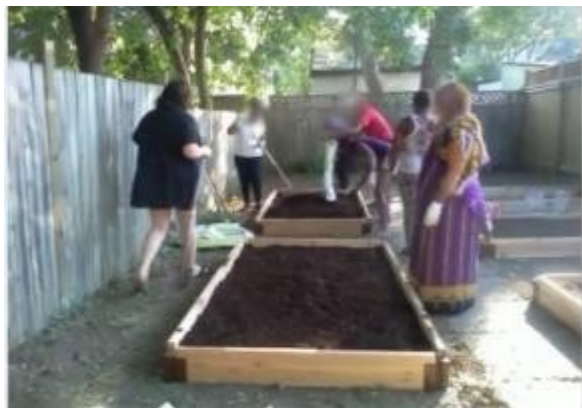
Finished preparing the beds

Last summer I had the beautiful privilege of creating and managing a community garden for the women staying in our houses. The project was started from scratch; we had to clear the back yard and build the garden beds. It was a lot of hard work, accomplished with the help of volunteers. We grew a variety of plants, including tomatoes, green onions, kale, and peas. Although there were challenges along the way, many of the women enjoyed partaking in garden activities, including the workshops hosted every month, teaching them how to garden and other environmental activities.