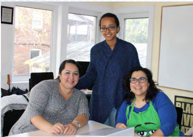
Team of FCJ Refugee Centre on weekends