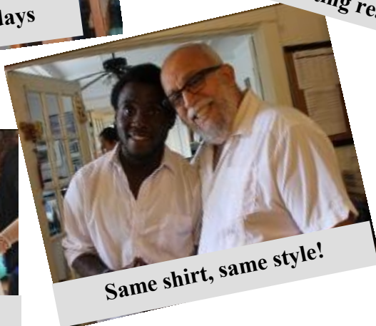
Same shirt, same style!