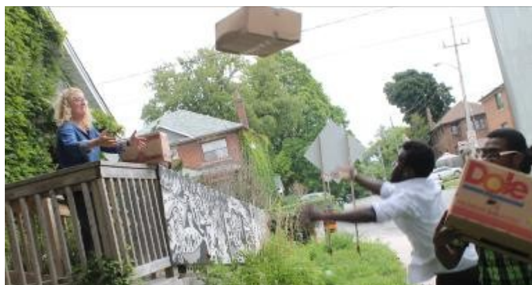
Some action during the food distribution: boxes flying