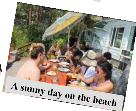
A sunny day on the beach