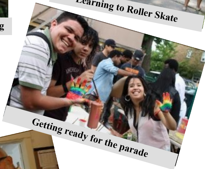
Getting ready for the parade