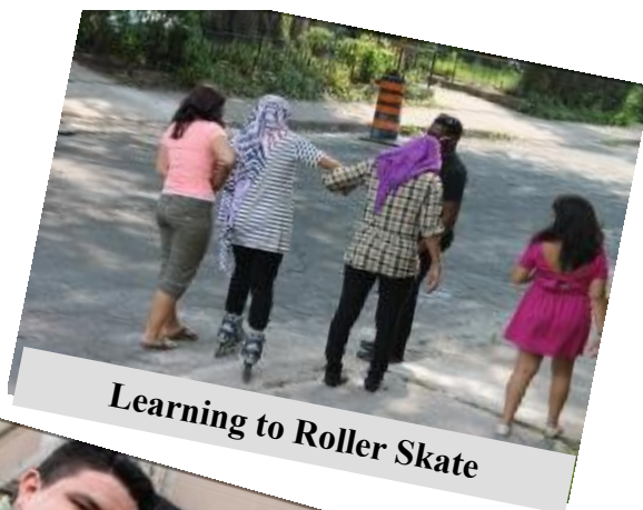
Learning to Roller Skate