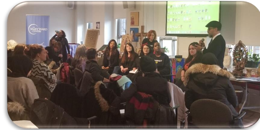
An Open Conversation on HT through Anti-Oppressive Lens forum