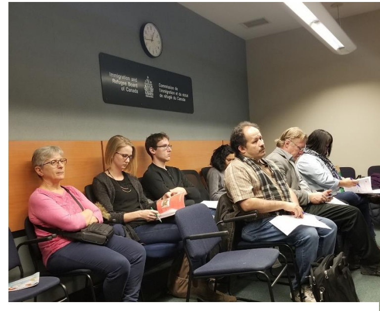
Coalition of Service Providers at the Ready Tour

The Refugee Hearing Tour and RAD info sessions are successful programs for the community. We coordinated 33 sessions with 672 participants during 2019