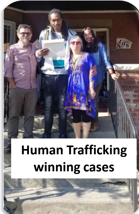
Human Trafficking winning cases