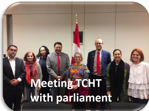
Meeting TCHT with parliament