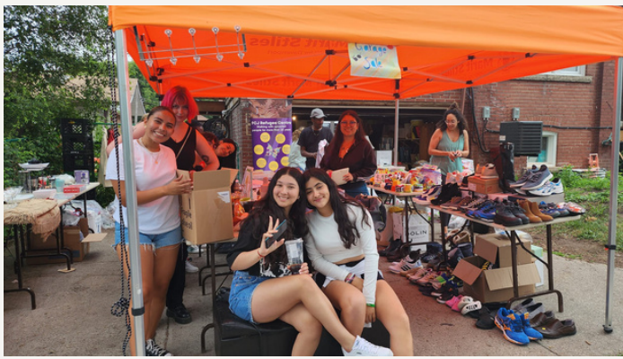
GARAGE SALE TO FUND RAISE FOR YOUTH IN ACTION GATHERING