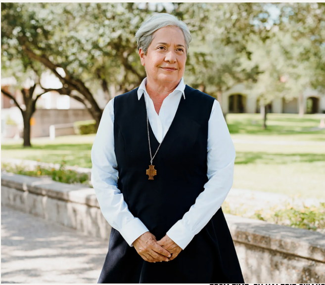
FROM TIME, BY VALERIE CHIANG